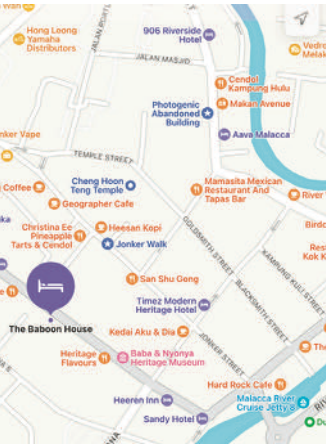
BABOON HOUSE 89 Heeren St